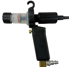
10 ML POWER DOSER™