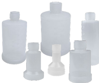
2 ML, 10 ML, 30 ML, 60 ML, 100 ML and 150 ML POWER DOSER™ BARRELS