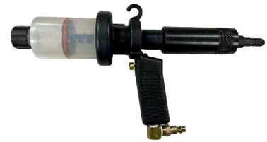
150 ML POWER DOSER™