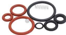
SPARE PARTS KIT for 2 ML, 10 ML, 30 ML and 60 ML POWER DOSER™