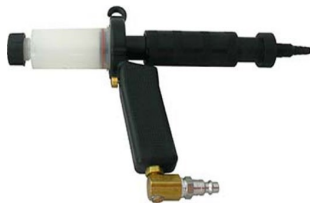
60 ML POWER DOSER™