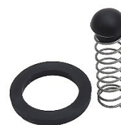
NOZZLE REPAIR KIT for 100 ML and 150 ML POWER DOSER™