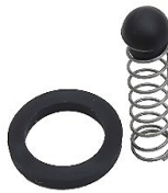
NOZZLE REPAIR KIT for 2 ML, 10 ML, 30 ML and 60 ML POWER DOSER™