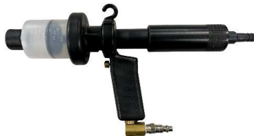
100 ML POWER DOSER™