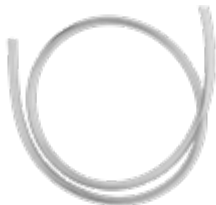
6 MM INLET TUBING for 2 ML, 10 ML, 30 ML and 60 ML POWER DOSER™