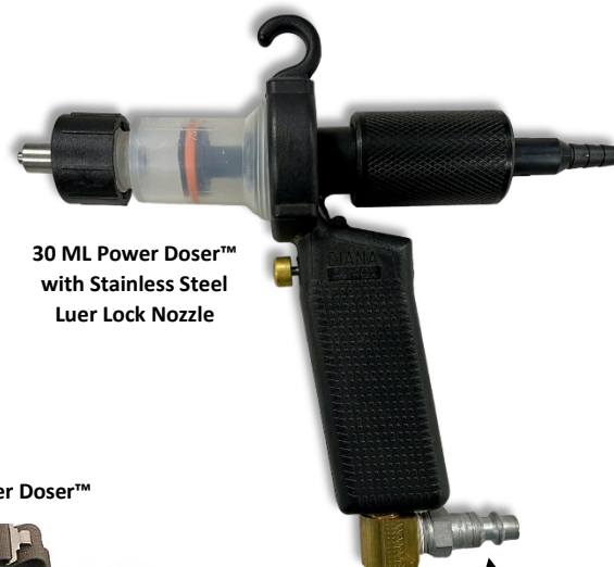
30 ML Power Doser™ with Stainless Steel Luer Lock Nozzle