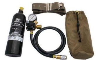
CO 2 KIT for POWER DOSER™