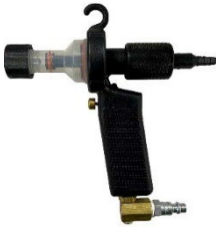
2 ML POWER DOSER™