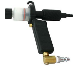
30 ML POWER DOSER™