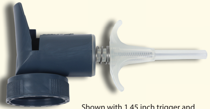
Shown with 1.45 inch trigger and 38 mm neck finish

Customization is available to meet specific manufacturer needs!