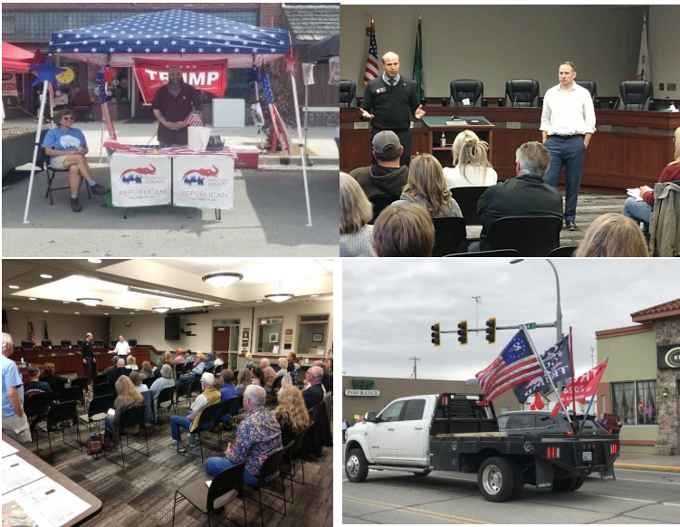
OCRCP PCOs representing and participating across the state!