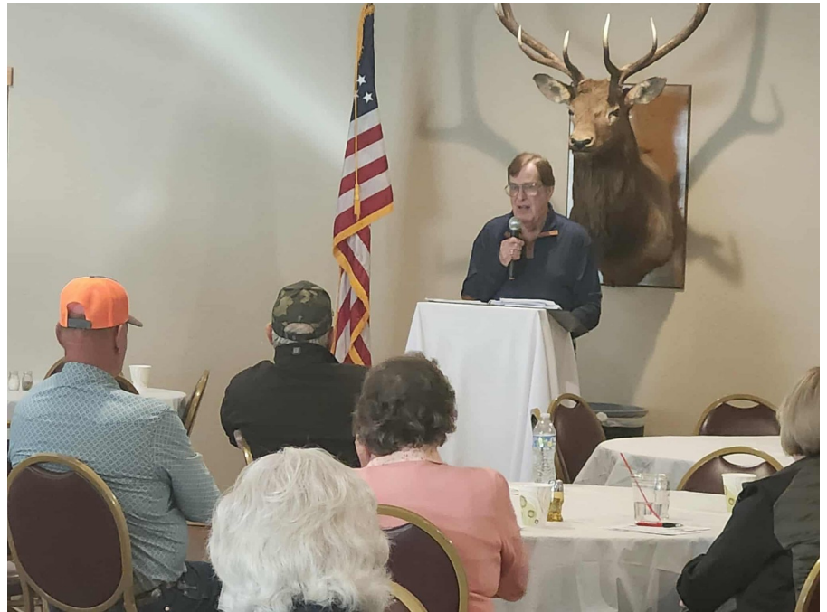
American Policy Center founder, Tom DeWeese, presenting on Defending American Sovereignty, Property Rights and Individual Freedom in Omak, WA. - Article on Page 5.