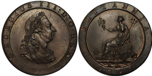
1865P. Cartwheel Penny, 1797. Soho. KM-618. Gorgeous satiny red and brown Choice to Gem Unc, pearly luster and great eye appeal. ($400-600)