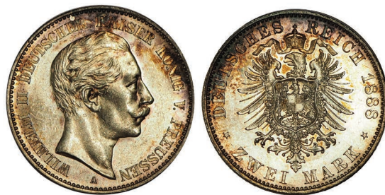
1706P. Key Transitional 2 Mark, 1888-A. Key date one year Wilhelm II type. KM-511. Colorful lustrous Unc, some faint contact obverse but flashy. ($300-400)