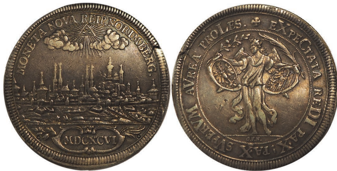
1698P. City View Taler, 1696. Dav. 5668, KM-228. Pleasing toned VF-EF, slight wave from roller die as made. Scarce. ($200-300)