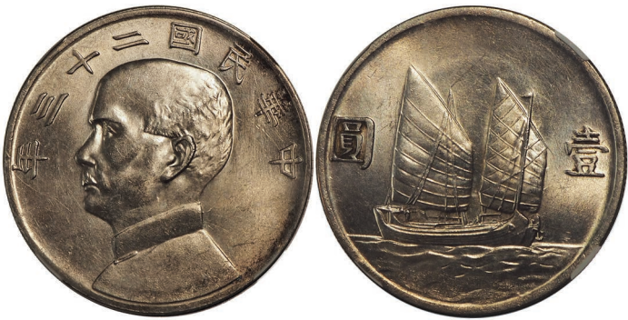
1536P. Sun Yat-Sen Junk Dollar, Yr.23(1934). KM-Y345, L&M-110. NGC MS62, strong luster. ($300-400)