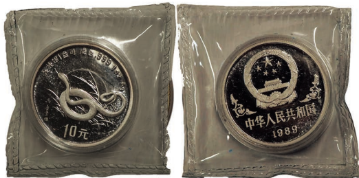
1537P. 10 Yuan, 1989. Year of the Snake Lunar 1oz Silver. KM-232. Cameo Brilliant Proof in capsule and pliofilm of issue, no case or COA. Reported mintage only 6000 pcs. Popular and scarce. ($200-300)

NUMISMATIC AUCTIONS LLC PO BOX 22026 LANSING, MI 48909 517-394-4443