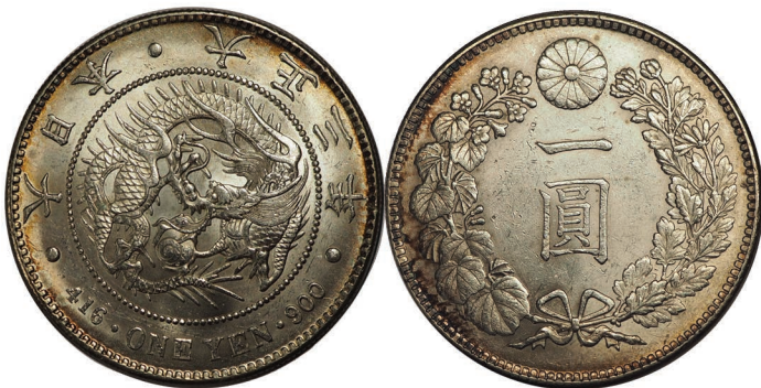
2089P. Yen, Yr.3(1914). Y-38. Unc, flashy luster obverse, some stray marks rev. ($200-250)