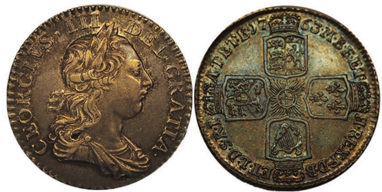
1874P. Northumberland Shilling, 1763. One year type. KM-597, S-3742. Gunmetal toned Choice EF/AU, reverse iridescence, tiny flan flaw well-concealed by the toning in the hair curls obverse. One from the famed lore of historic distribution in Dublin, Ireland by Hugh Percy while Viceroy and Lord Lieutenant. Mintage believed to be only around 3000 pcs. ($750-1000)