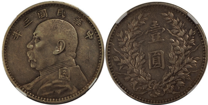
1535P. Yuan Shih-Kai Fatman Dollar, Yr.3(1914). KM-Y329, L&M-63. NGC XF45. ($200-300)