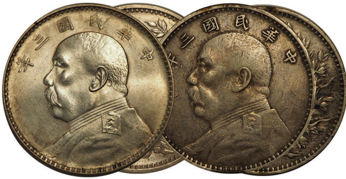
1534P. Yuan Shih-Kai Fatman Dollar, Yr.3(1914), KM-Y329, L&M-63. Faintly hairlined fully lustrous Unc and VF, rbs. 2 coins. ($300-400)