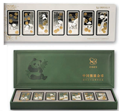
1538P. 7 Piece 35 th Anniversary Chinese Panda 50g Silver Bar Proof Set, 2017 & 5 Dynasties/20 Centuries of Cash Coins Set. Features seven different ingots, AR .999, 350g total weight Panda Bar Set with Gold overlay. NGC Certified as Gem Proof w/Photo Certificate in leather presentation case, box and COA's plus Cash Coin Set of Han, T'ang, Song, Ming and Q'ing Dynasty issues, Fine to EF in wooden presentation case with COA. Both original Gov Mint promotional sets. 7 ingots/bars + 5 Cash Coins. ($400-600)