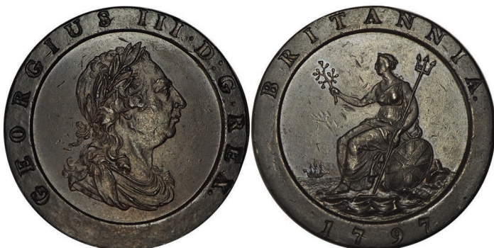
1868P. Cartwheel Twopence, 1797. Soho. KM-619. Lovely glossy brown AU-Unc with much nicer rims than typically encountered. ($200-300)