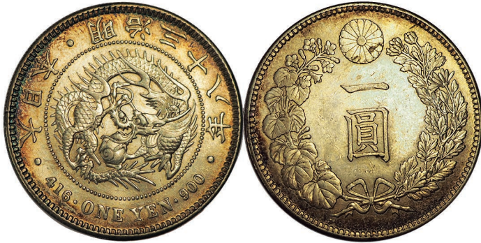
2088P. Yen, Yr.38(1905). Y-A25.3. Unc, pale gold and violet toning. ($200+)