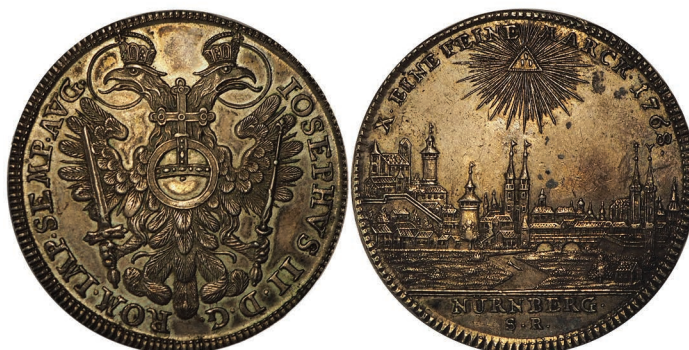
1699P. City View Taler, 1768-SR. Dav. 2494, KM-350. Sharp Choice EF, cpl wispy hairline scs and a few lt toning spots reverse. ($200-300)