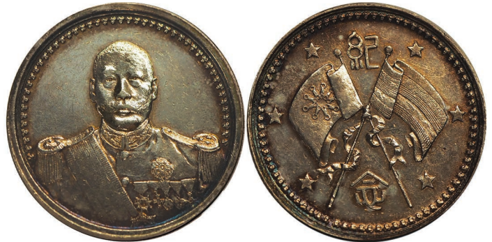
1539P. [Medal] Tsao Kun Silver Medal, ND(1923). Plain edge. L&M-960. AU, expert edge mount removal, retoning nicely from a light old cleaning. Quite attractive and rarely offered. ($2000-2500)