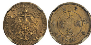
1541P. Kiau Chau. 5 Cents, 1909. KM-1. NGC MS63. Rare in Mint State. ($500-750)