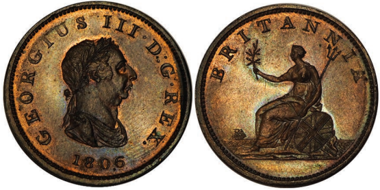
1864P. 1/2 Penny, 1806. No Berries. KM-662. Lovely red and brown Choice to near Gem satiny Unc. ($150-200)