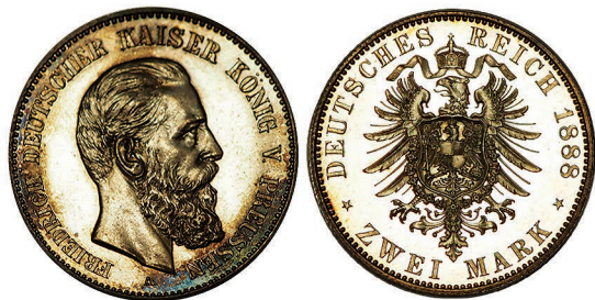
1705P. Rare Proof 2 Mark, 1888-A. KM-510. Ltly toned Brilliant Proof with slight cameo contrast reverse. Nice example with neat mirrors on this one year type. ($300-400)