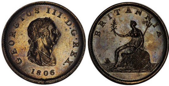
1863P. 1/2 Penny, 1806. 3 Berries. KM-662. Choice reflective brown Prooflike Unc. Ex: Spink. ($200-250)