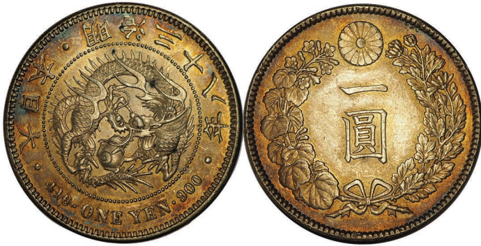
2087P. Yen, Yr.38(1905). Y-A25.3. Handsome amber toned Unc with underlying luster, some lt stray marks rev. ($200-250)