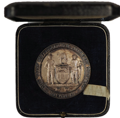
1540P. [Medal] Min Yuan International Athletic Meeting – Tientsin, Award Medal for Cross Country in Silver, 1930. AR or Silvered AE(no hallmarks), 45mm, by Fattorini. Deep golden toned AU in original velvet lined case of issue. Rare and desirable. ($150-200)