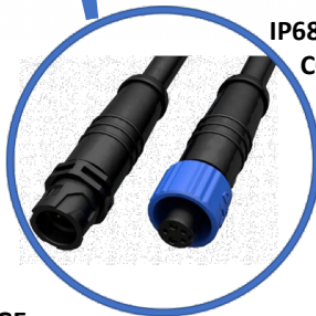
IP68 WATERPROOF CONNECTORS