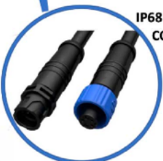
IP68 WATERPROOF CONNECTORS