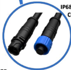
IP68 WATERPROOF CONNECTORS