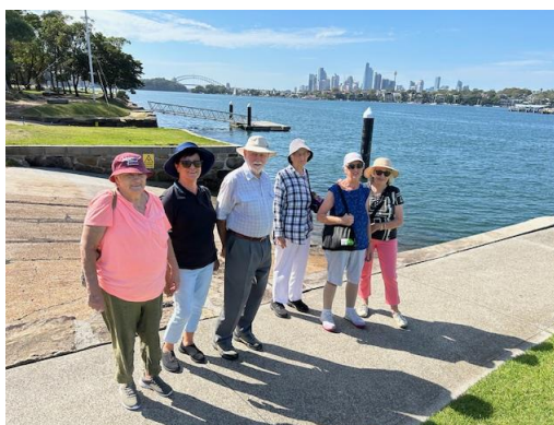
Pictures from recent outings a) Water Recycling Centre and b) Hunters Hill Walk