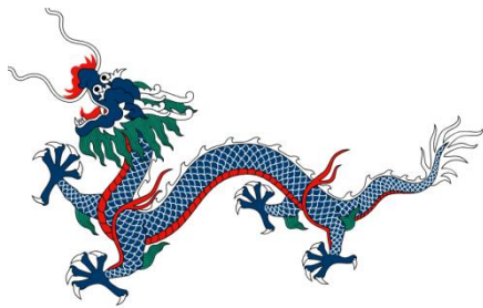
:Flag of China (1889–1912).

This time we offer you a wonderful Chinese banquet.