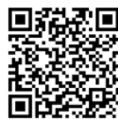
QR code to volunteer