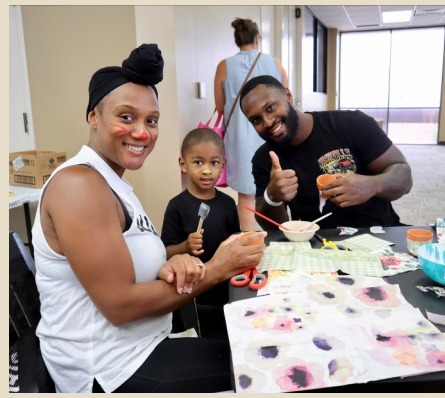
Family makes flower pots.