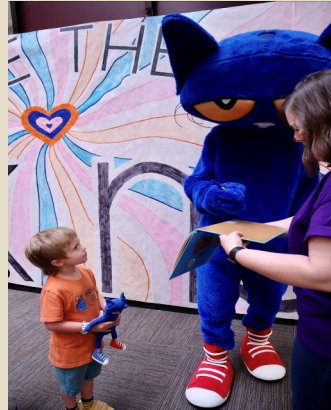
Children meet Pete the Cat.