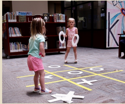
Children play oversized tic-tac-toe.