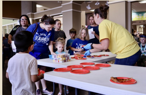
Families lined up to sign up for Summer Reading.