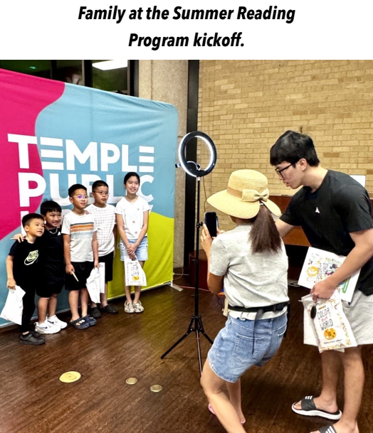
Family at the Summer Reading Program kickoff.

Scan to access Temple Public Library's calendar of programs and events