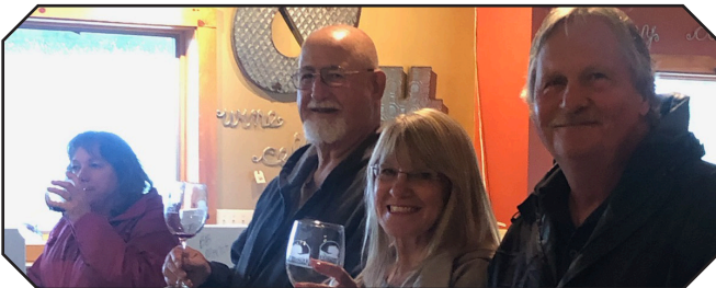
Wine tasting Nashoba Winery