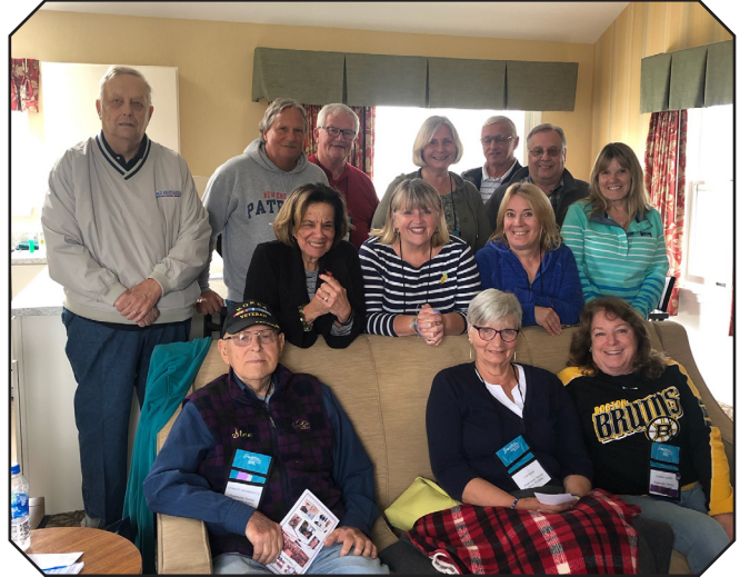
Retiree Spring Meeting