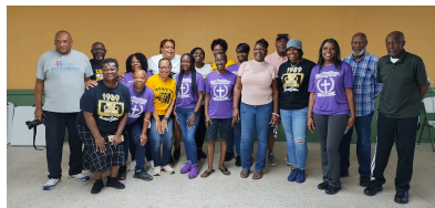
New Providence Missionary Baptist Church & Mayo Class of 1989