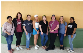
Trinity Presbyterian Church