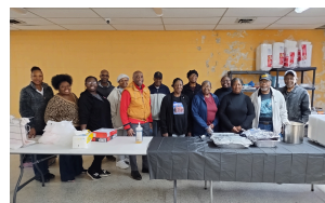
Cherry Grove Missionary Baptist Church