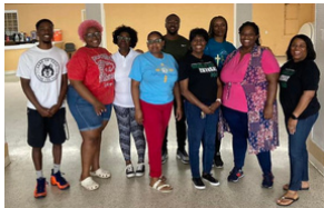
Glorious Remnant Revival Church