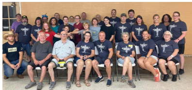
Mechanicsville Baptist Church