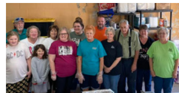
Free Will Bible Church