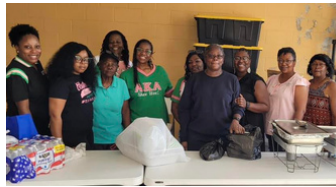
Flat Creek Baptist Church & Omega Omega Omega Chapter of Alpha Kappa Alpha Sorority