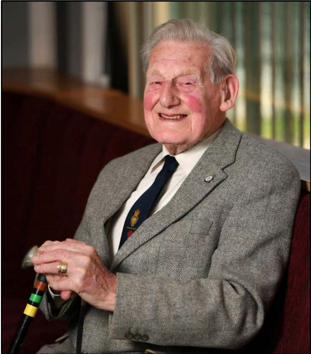
Picture: Neville Foote RA. February 1919 – June 2019.