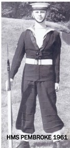
HMS PEMBROKE 1961