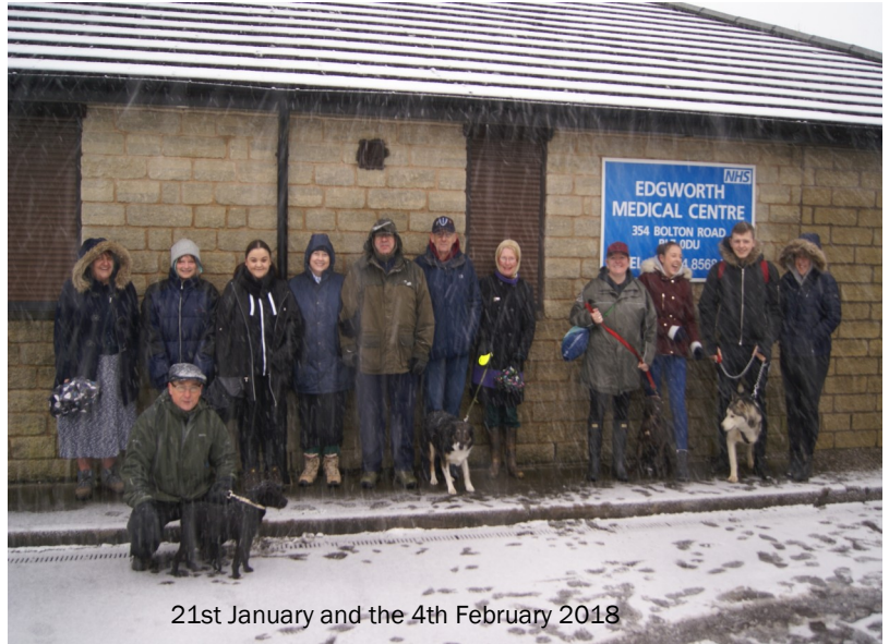
21st January and the 4th February 2018

BOBVA Ramblers and four legged friends braved a wintery assault course around Wayoh and Entwistle reservoirs, unfortunately abandoned at the half-way stage due to frost bite and snow blindness. Thankfully the medics amongst us managed to get all troops back to base successfully. The full walk was rearranged for a nicer day and was enjoyed by everyone attending. The ramble finished in the Black Bull at Edgworth where refreshments were taken.