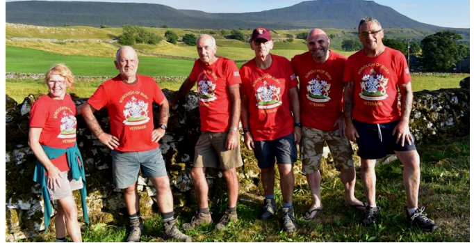
Leaving Pen-y-Ghent on route to Whernside, the highest peak far in the distance.