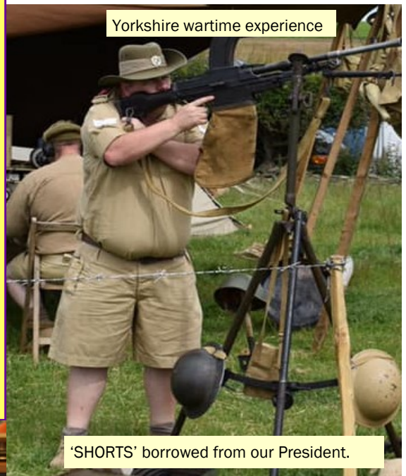
Yorkshire wartime experience