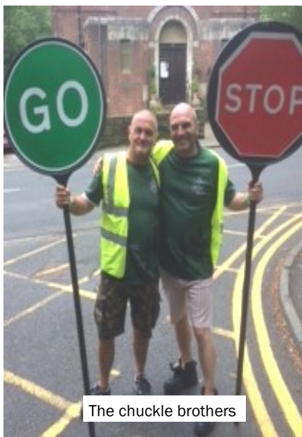
The chuckle brothers