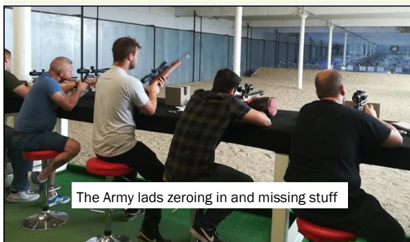
The Army lads zeroing in and missing stuff