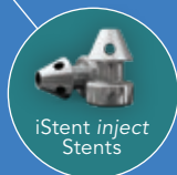
iStent inject Stents

Compliments of Sand Pacific Eye Group www.sandpacificeye.com