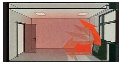
REXNORDIC infrared heater