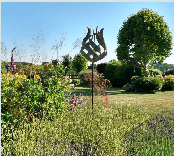
Tulip Copper sculpture & wind spinner