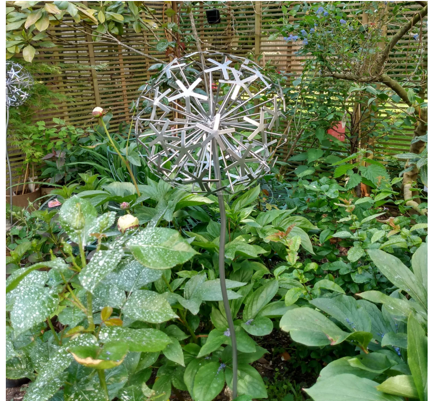
Large Allium silver metal stake – 1.4m