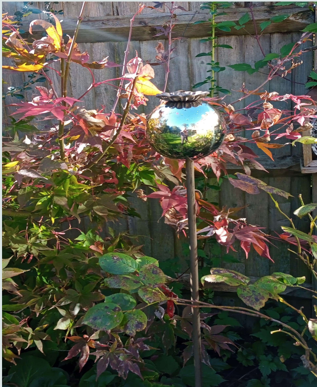
Large Mirror Poppy stake