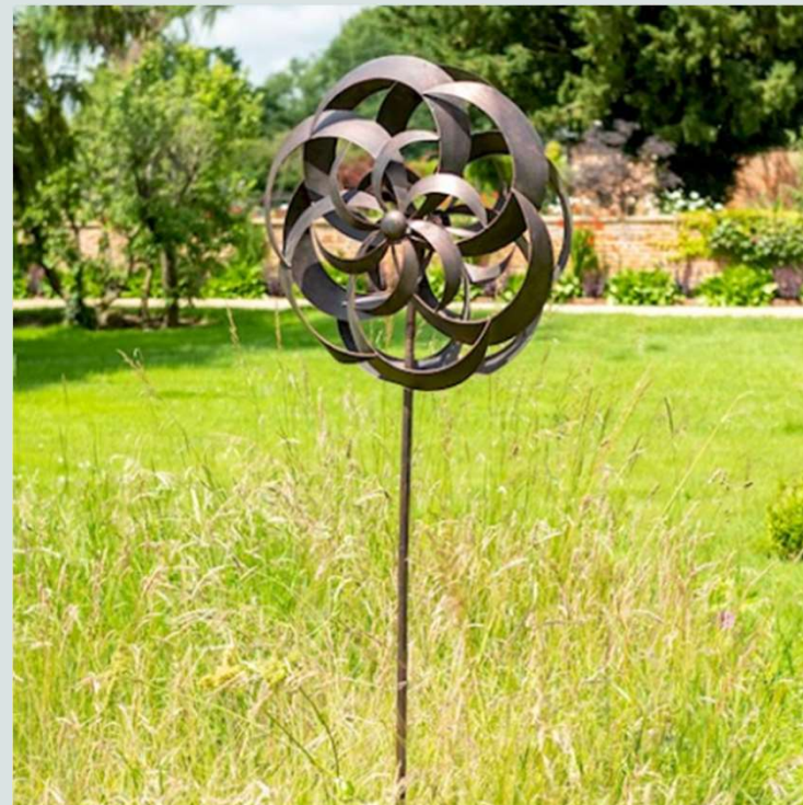
Circular Dual Winder Spinner - bronze