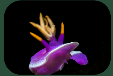
Exclusive for 12 Passengers