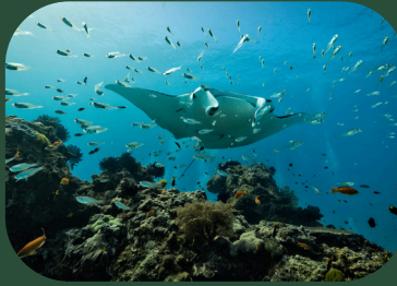
February 21- March 8, 2028