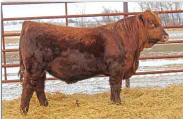
KS VANDERBILT G220