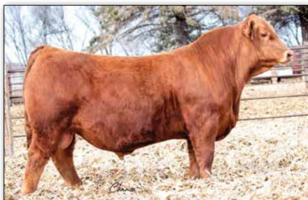
ROCKIN H CAPTIVATE J75

CE BW WW YW MCE MILK MW STAY CW YG MARB BF REA 4.8 2.6 99.4 147.6 4.1 27.8 77.4 15.9 42.3 -0.07 0.40 0.000 0.67 99% 95% 4% 10% 90% 20% 4% 40% 40% 85% 50% 90% 55%