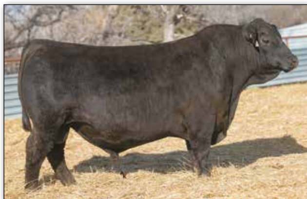
TNT EXEMPLIFY K508

CE BW WW YW MCE MILK MW STAY CW YG MARB BF REA 6.0 3.3 111.5 181.0 4.8 29.1 84.7 22.6 63.0 -0.30 0.25 -0.064 1.14 95% 99% 1% 1% 85% 15% 1% 2% 5% 20% 75% 15% 3%