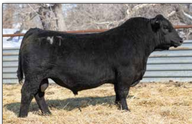
TNT ASSURANCE J455

CE BW WW YW MCE MILK MW STAY CW YG MARB BF REA 18.1 -3.8 70.1 104.4 9.5 36.7 71.6 19.0 31.2 -0.30 0.46 -0.078 0.61 3% 2% 85% 80% 5% 2% 20% 15% 60% 75% 15% 45% 95%