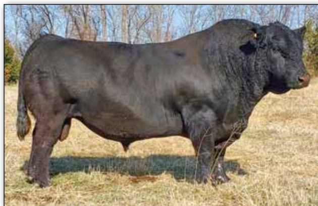
COLORADO BRIDLE BIT E752