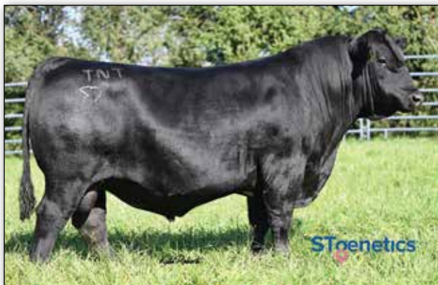
CLEMSON ELITE 41J