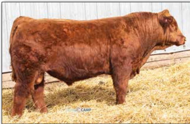
CHSR EQUALIZER 59H