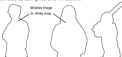
Athletes Image In White Area

Laser Cut 1/8" acrylic silhouette and image of your athlete. Item is approximately 11" tall, width will vary based on pose. It will come with your order in 2 pieces and the upright will snap into the base made of 1/4" acrylic. Pose will determine the shape. We use roughly from the thighs/knees up. Silhouette samples shown below.