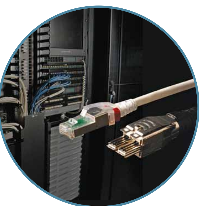
Category 7 and 7_{\rm A} are internationally recognized cables and are shielded for maximum protection against noise and interference.

mainly follows international standards, says, "The rationale for recommending category 6A ScTP over category 6A UTP is based on the benefit that alien crosstalk becomes a non-issue with a screened or shielded cable." It should be noted that a shielded category 6A is often also smaller in diameter than an unshielded category 6A.