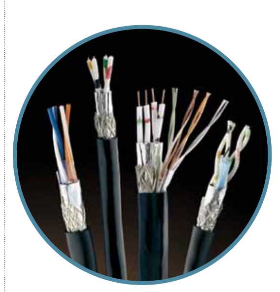
Early IBM Type cables, dating back to the 1980s, preceded the design of the category cables.

Most of us know that the first recognized category cable was category 3. But what came before that? Was there a category 1 and 2? The answer to that question comes all the way from Spain. Luis Semprun, owner of Data Structures in Madrid, says, "The answer stems way back from the dinosaur ages before there were standards. The first 'Ethernetsaurus' cable was actually a telephone-grade cable, and then grade 2 was for integrated services digital network (ISDN) systems."