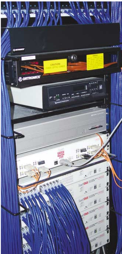
Racks: The MC in the Cooper-Whiteside Elementary School (Padukah, KY) included the Ortronics Mighty Mo II cable management racks that house the Category 6 connectivity, fiber distribution enclosures, coax patch panels and all the electronics for voice, data and video. The cable then goes up the conduits into the ceiling and is horizontally distributed.

sible structured cabling system. The students and teachers have become well connected and are now appreciating the many benefits of Internet access, as well as advanced educational software tools.