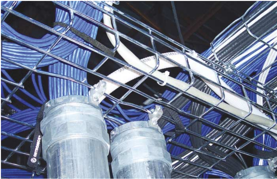
CeilingCable: The Berk-Tek LANmark-2000 data cabling runs above the ceiling to the student and teacher desks at Cooper-Whiteside Elementary School (Padukah, KY).