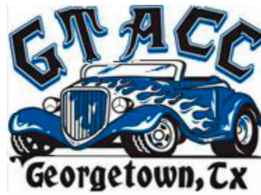
GTACC at September Pistons on the Square