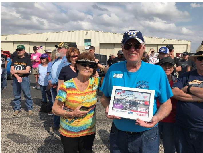
What GTACC member showed his plane?