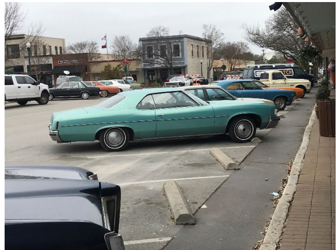
My favorite, a 1970 Olds Toronado!