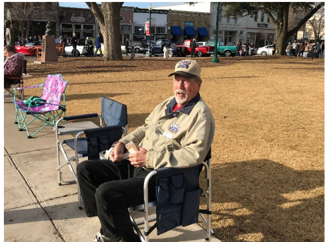
Members Enjoying the Texas sun!