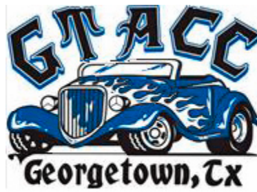
GTACC members cars lined up at airport show