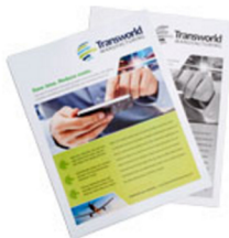
Copies & Flyers

Copy & Print Depot™ delivers everything from business cards to banners, presentations to promotional products. Order custom printing online or in-store. Same Day printing and pickup options are available on many items. Visit officedepot.com/sameday for details.