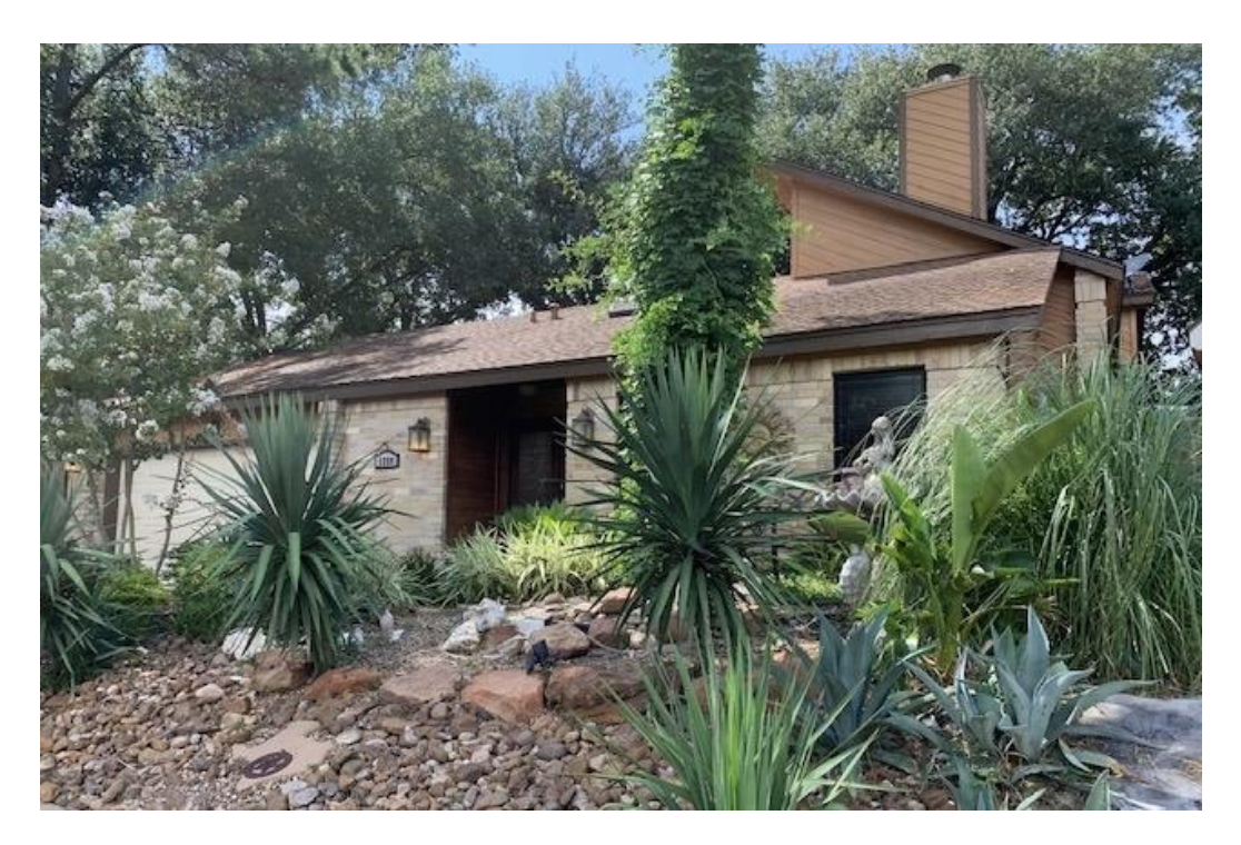
SBCA YARDS OF THE MONTH FOR AUGUST: Congratulations to homeowners at 1359 Bullock and 9771 Larston!