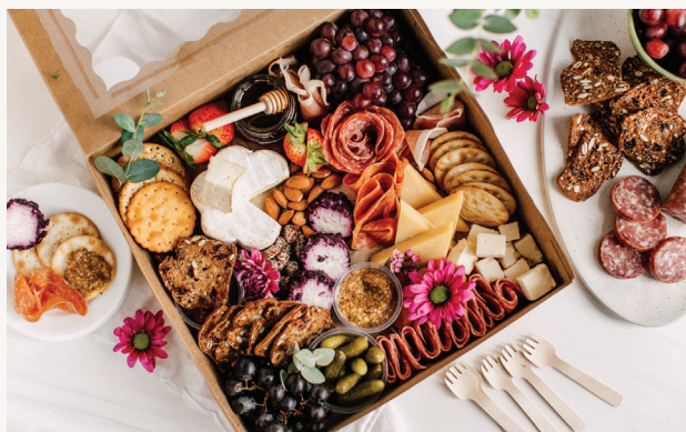
THE GRAZER $60 Feeds 4-6