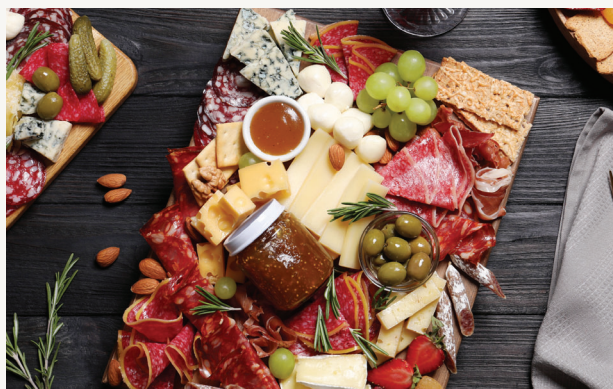
THE PICNIC $90 Feeds 6-8