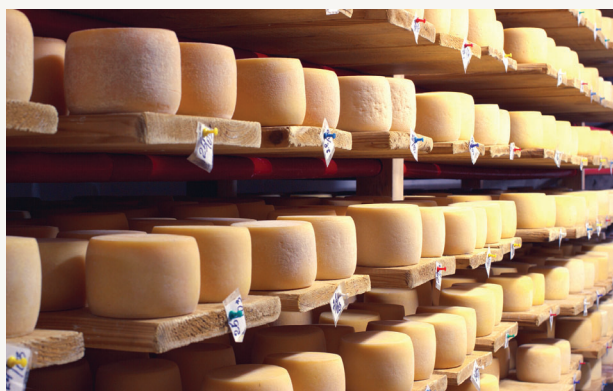
HEAVEN OR HAVARTI $199 Feeds 10-12