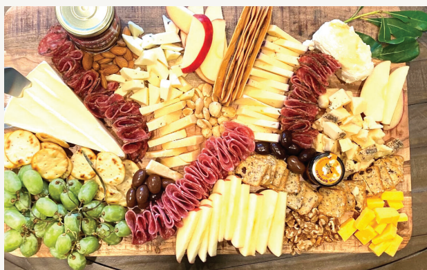
THE FORAGER $129 Feeds 8-10