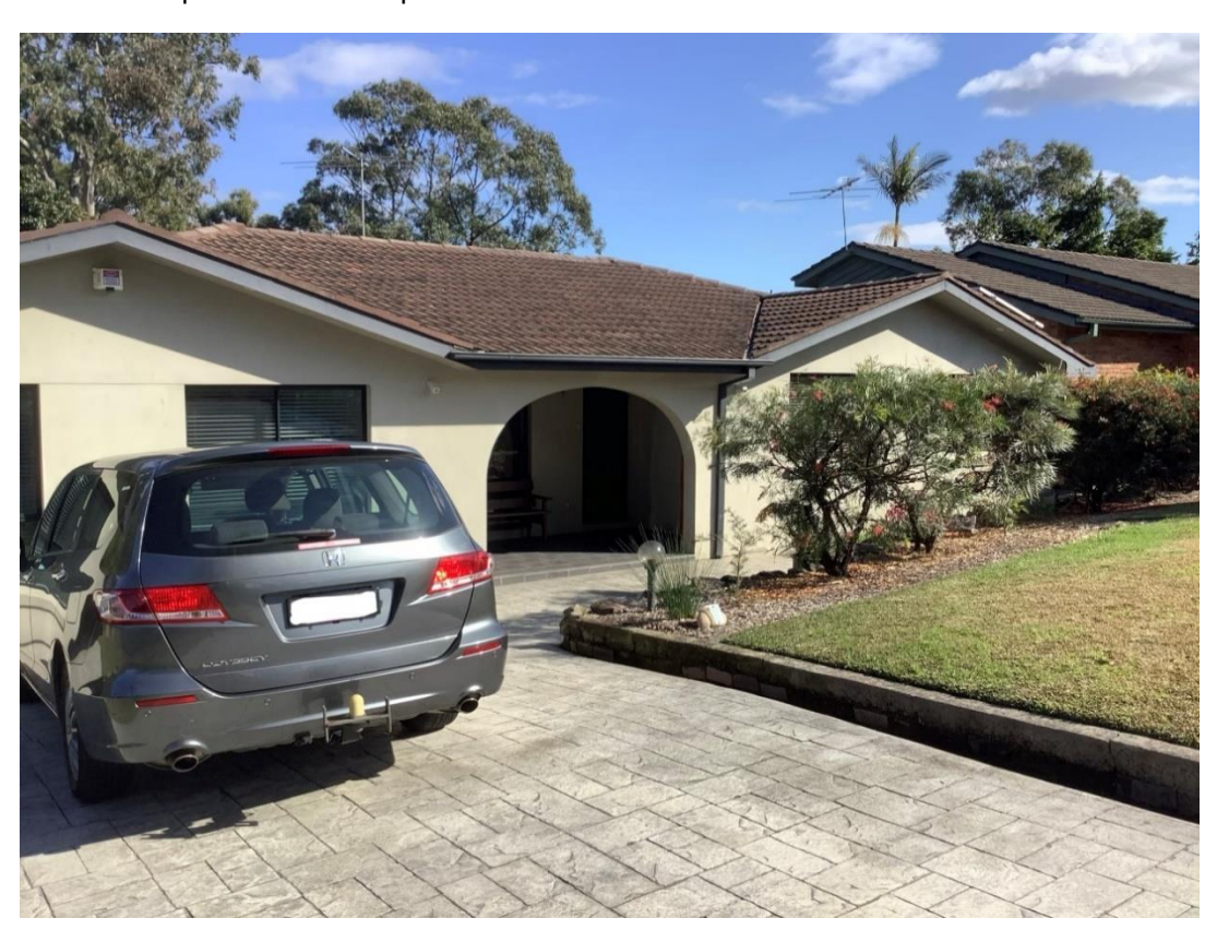
Photo 1: Roof (outside), an outside photo of the whole house (for an idea of size). These can be done in one photo. See Examples below: