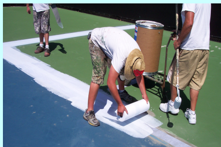
Applying RiteWay Stress Mat