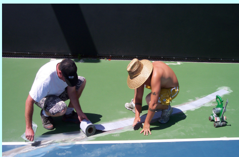
Applying Exclusive RiteWay Tape