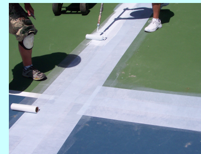
Applying RiteWay Bonding Edge