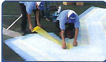
3. Applying RiteWay Bonding Edge