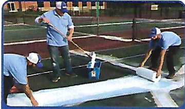
2. Applying RiteWay Stress Mat