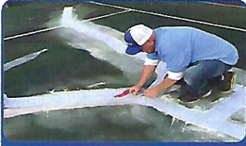
1. Apply Exclusive RiteWay Tape

When You Fix a CRACK "Do It The RiteWay"