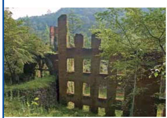
Sweetwater Creek State Park

Stars and planets will look surprisingly sharp despite Atlanta's lights and pollution thanks to Fernbank's 36-inch reflecting telescope, one of the largest available in Georgia to non-astronomers. A Fernbank astronomer will be on hand to point out planets and stars. Throughout the summer, stargazers can spot ringed Saturn high in the eastern sky, a polar ice cap on Mars straight overhead, and Venus in the west. With the help of a telescope, lunar craters 100 miles wide will be visible. Admission to the observatory is free. Arrive at 8 p.m. and watch the planetarium show "Rocks From Space," which is $4 for adults, $3 for children. 156 Heaton Park Dr., Atlanta. 678-874-7102.