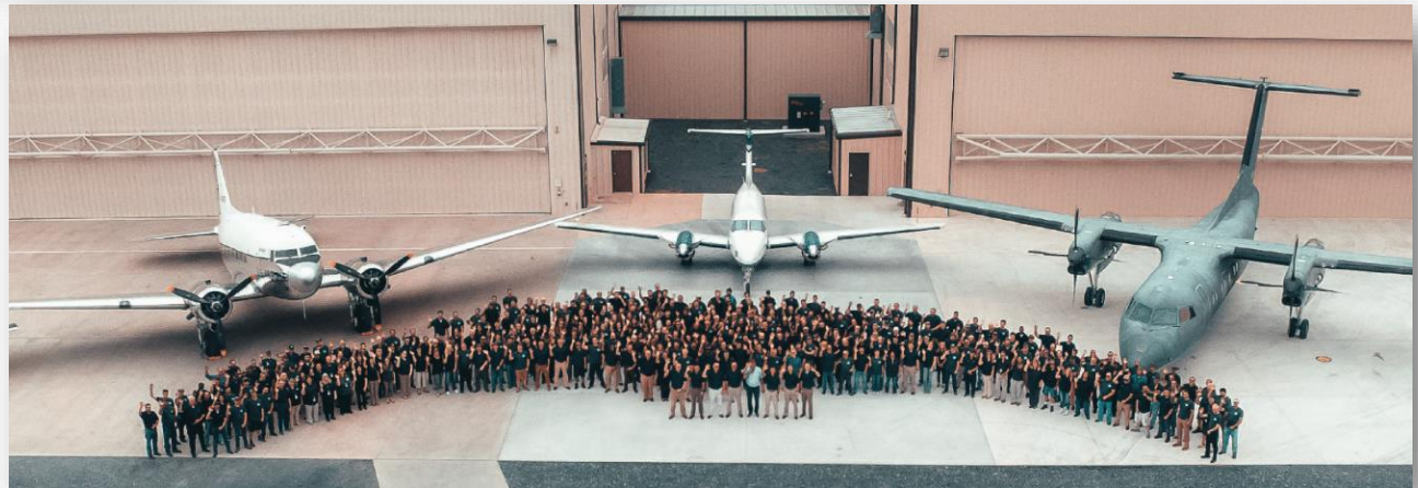
Meetup #10, Sugar Mountain, NC 8/9-11/24