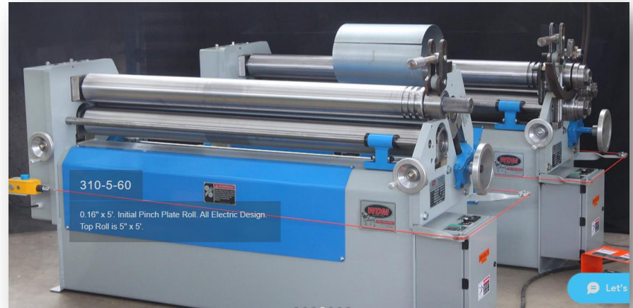
Waldemar Design & Machine (WDM), Spencer, TN Sheet Metal Rolling Equipment