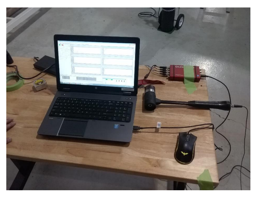
Calibrated hammer alongside the 4-channel signal analyzer and laptop used during the tests.