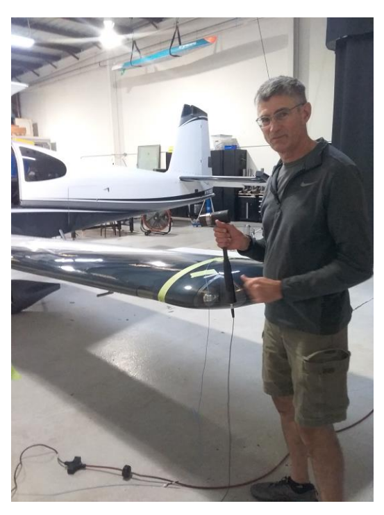
The author preparing for tests on a beautiful RV-10ER.