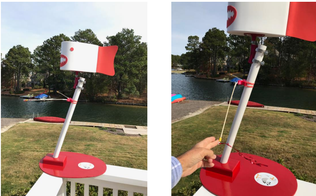
Above, left: Breezy on a test rig, mounted with several rubber bands beneath an AeroSouth Dinghy Bob; Above, right: Shows how the arms of a Breezy will flex without breaking. Black magnetic tape is attached to the right arm and red shred tape is attached to the left arm.

Should a collision with one of the arms occur, the PE tubing coupler will flex, even in cold temperatures. It does not spring back immediately as with metal springs but will return to its original orientation in a few seconds. Important – keep your ribbons light and thin to avoid wind drag on them that might cause the arms to flex while sailing. Those sent with your Breezy are ideal, very sensitive to slight winds and should last an entire sailing season.