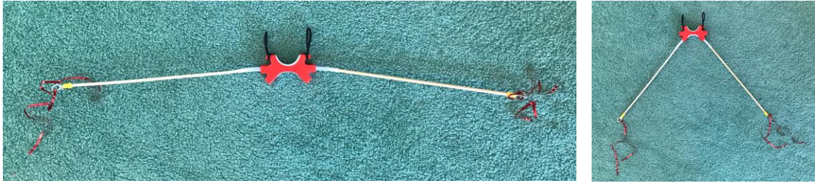
Above: Arms are inserted with plastic flex couplers into either set of holes to orient the arms' spread of either 180 degrees or 90 degrees, depending on your preference.