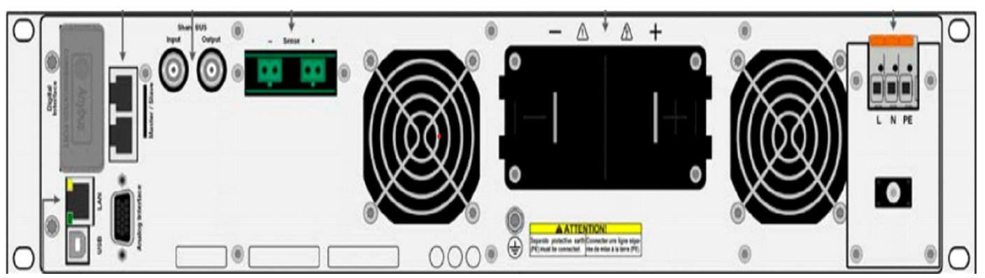
E/PS 10000-2U rear