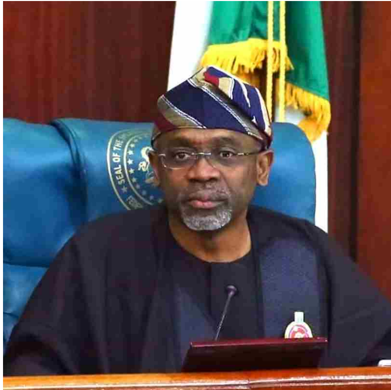
HIS EXCELLENCY HON. FEMI GBAJABIAMILA SPEAKER, FEDERAL HOUSE OF ASSEMBLY FEDERAL REPUBLIC OF NIGERIA