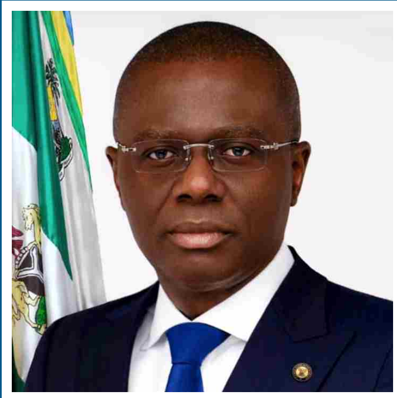
HIS EXCELLENCY BABAJIDE OLUSOLA SANWO-OLU GOVERNOR OF LAGOS STATE