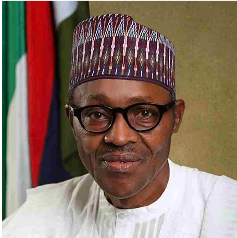
HIS EXCELLENCY MUHAMMADU BUHARI PRESIDENT, COMMANDER-IN-CHIEF OF THE ARMED FORCES FEDERAL REPUBLIC OF NIGERIA