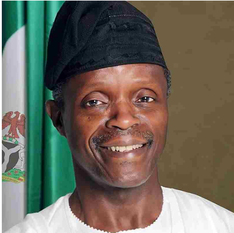
HIS EXCELLENCY PROF. YEMI OSINBAJO SAN VICE PRESIDENT FEDERAL REPUBLIC OF NIGERIA