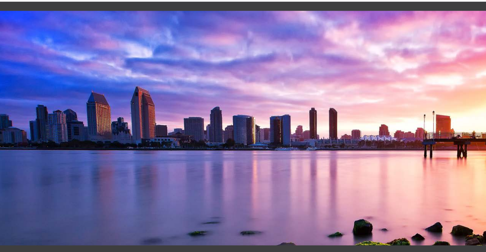
Exhibit Prospectus & Sponsorship Opportunities

AUGUST 27-29, 2026 • ESTANCIA LA JOLLA HOTEL • SAN DIEGO, CALIFORNIA