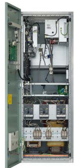
Internal view of a SDC single configuration system.