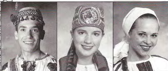
Mike Brown Family Science, UT