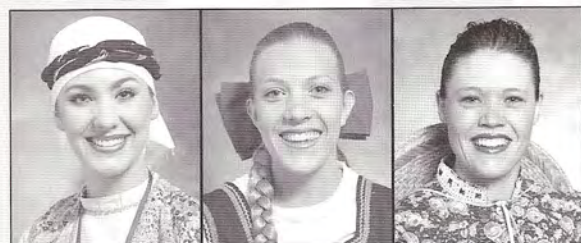
Christina Butler Dance Education, UT