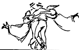
INTERNATIONAL FOLK DANCE ENSEMBLE

Int'l Folk Dance Ensemble Brigham Young University Alumni Newsletter 259 RB Provo, UT 84602