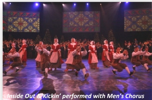
Inside Out & Kickin’ performed with Men’s Chorus

One particular highlight of the production was a Welsh Suite, Inside Out and Kickin’ , performed by the Performing Arts Company and BYU Men’s Chorus. Putting this together was a monumental task that covered a lot of logistical planning. The choir had their own performance on the