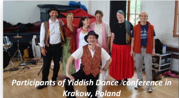
Participants of Yiddish Dance conference in Krakow, Poland