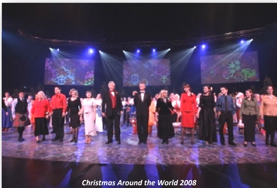
Christmas Around the World 2008