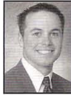
Gregg Crockett Elementary Ed. Orem, UT