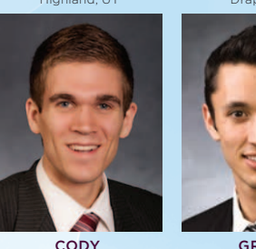
Business Management Albuquerque, NM