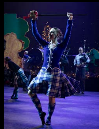
Scotland: Royal Highland Broadsword