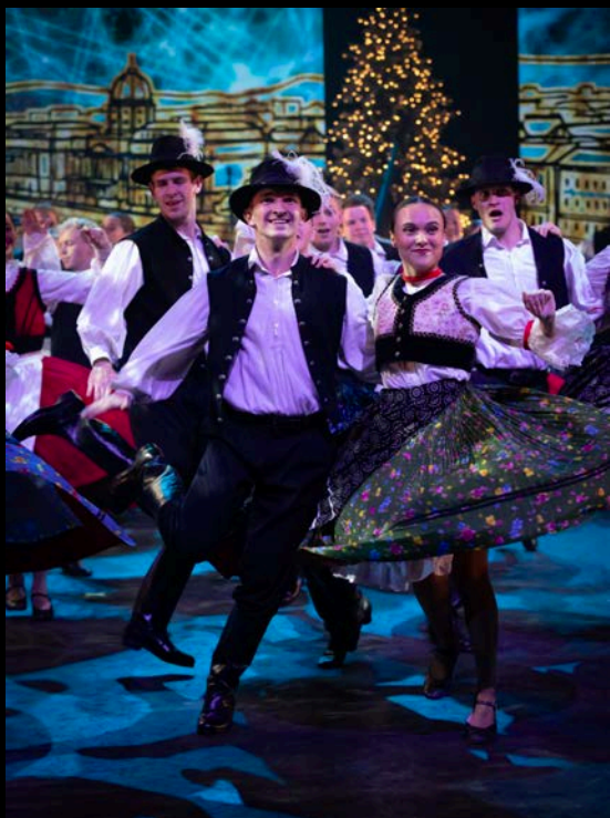
Hungary: Szatmári Friss Csardas