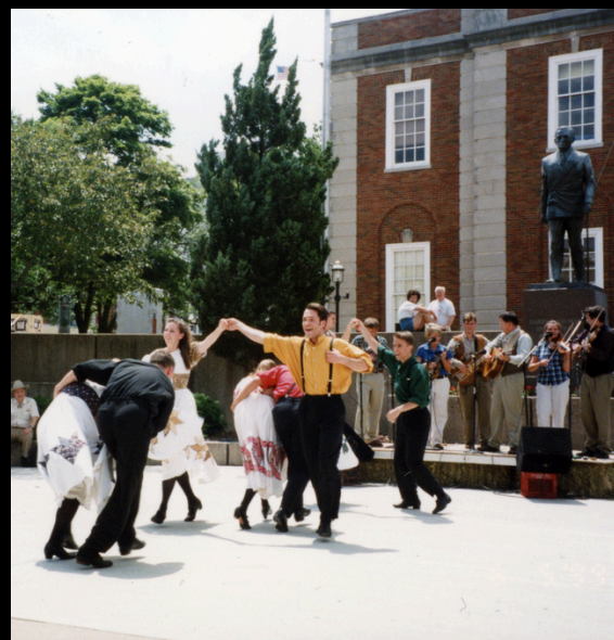
Performing in front of the Harry S. Truman Historic Site in Independence, Missouri