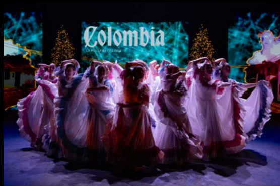
Colombia: La Pollera Colorá