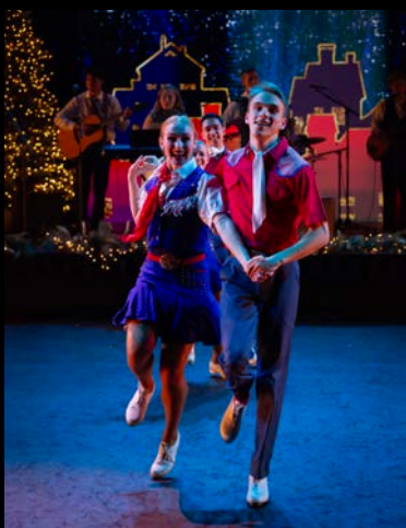
USA: Freight Train