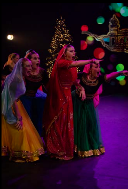
India: Ghar Waapasi