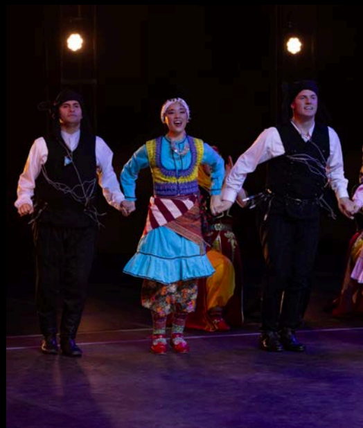
Turkey: Tides of Anatolia