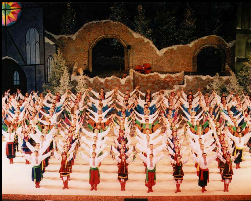
Christmas Around the World: Lithuanian, Russian, and Finale