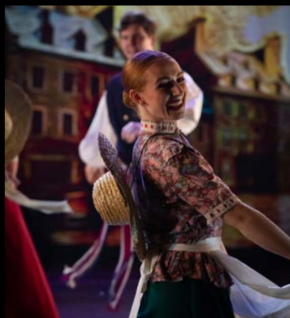
Canada: Attache tes Bottines