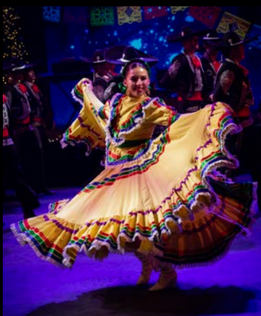
Mexico: Jalisco Madrugada