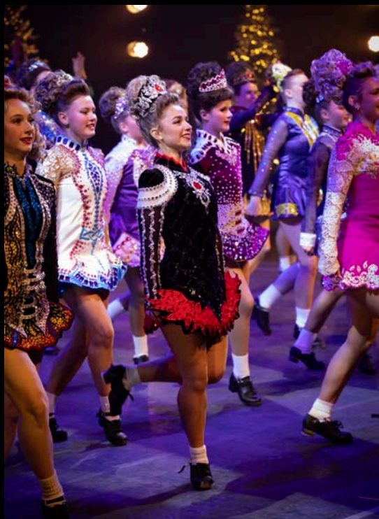
Ireland: Yuletide Medley